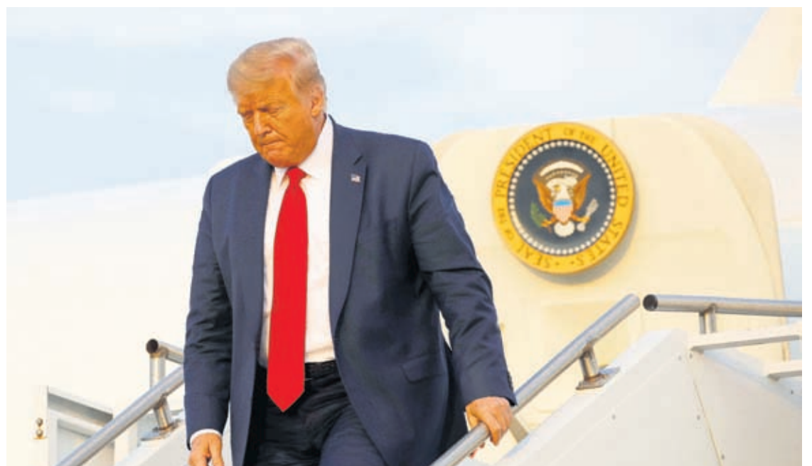
In this July 24, 2020, file photo President Donald Trump steps off Air Force One at Morristown Municipal Airport in Morristown, N.J.

Those political headwinds have sparked a sudden summer shift in the White House and the Trump campaign. After spending months playing down the pandemic and largely ignoring the virus' resurgence in several states, Trump warned this past week that the situation is likely to get worse before it gets better.